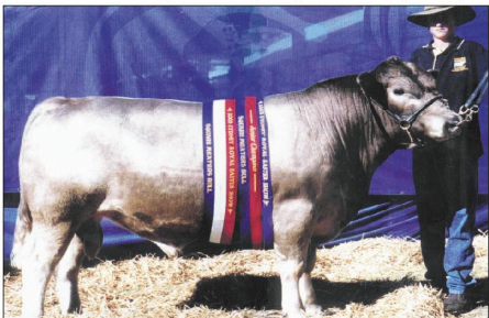
Grand Champion Bull 2003 Sydney Royal Show

For further details ring Robert on 0427 671 276 or visit the Website: riversands.net.au